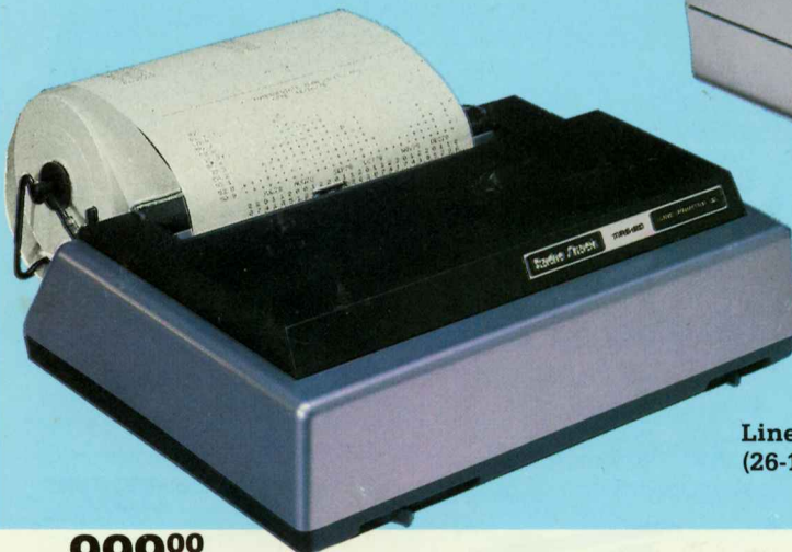
Line Printer III (26-1156)